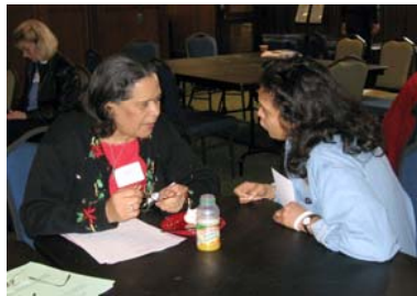
Participants in the Diocese of Washington