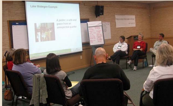
Fresh Start training session at St. Christopher's Conference Center, SC

Underlying Principles. Fresh Start's content is based on three key principles: the theory of transition; the importance of relationship-building; and the need for self-care. Modules are clustered around these principles and the general area of leadership.