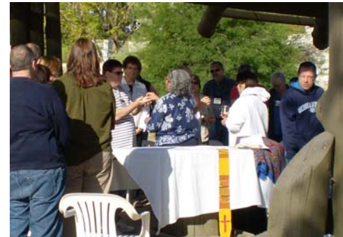
Celebrating Holy Eucharist at a training conference

The remaining modules offer a broad array of topics. Some are theory-based. Others focus on establishing relationships or self-care.