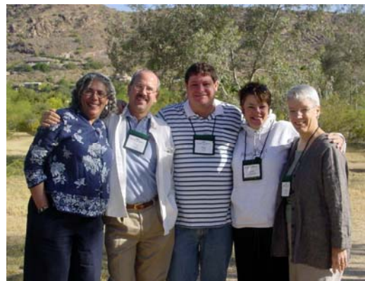
Training event faculty