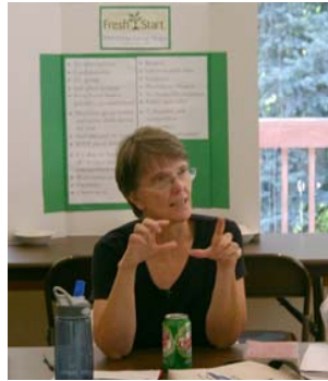
Participant in the Diocese of Oregon

"This is well thought-out material, written at a high level and has potential to help people in the church."